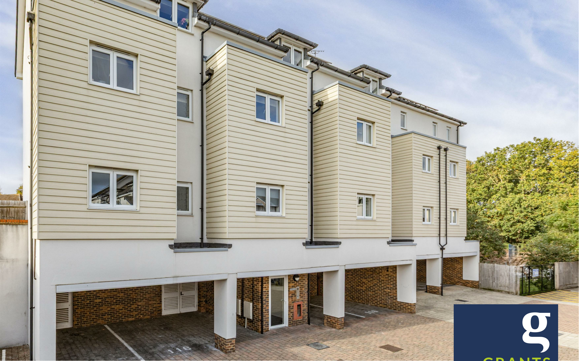
Pyle Close, Addlestone, KT15 2FF